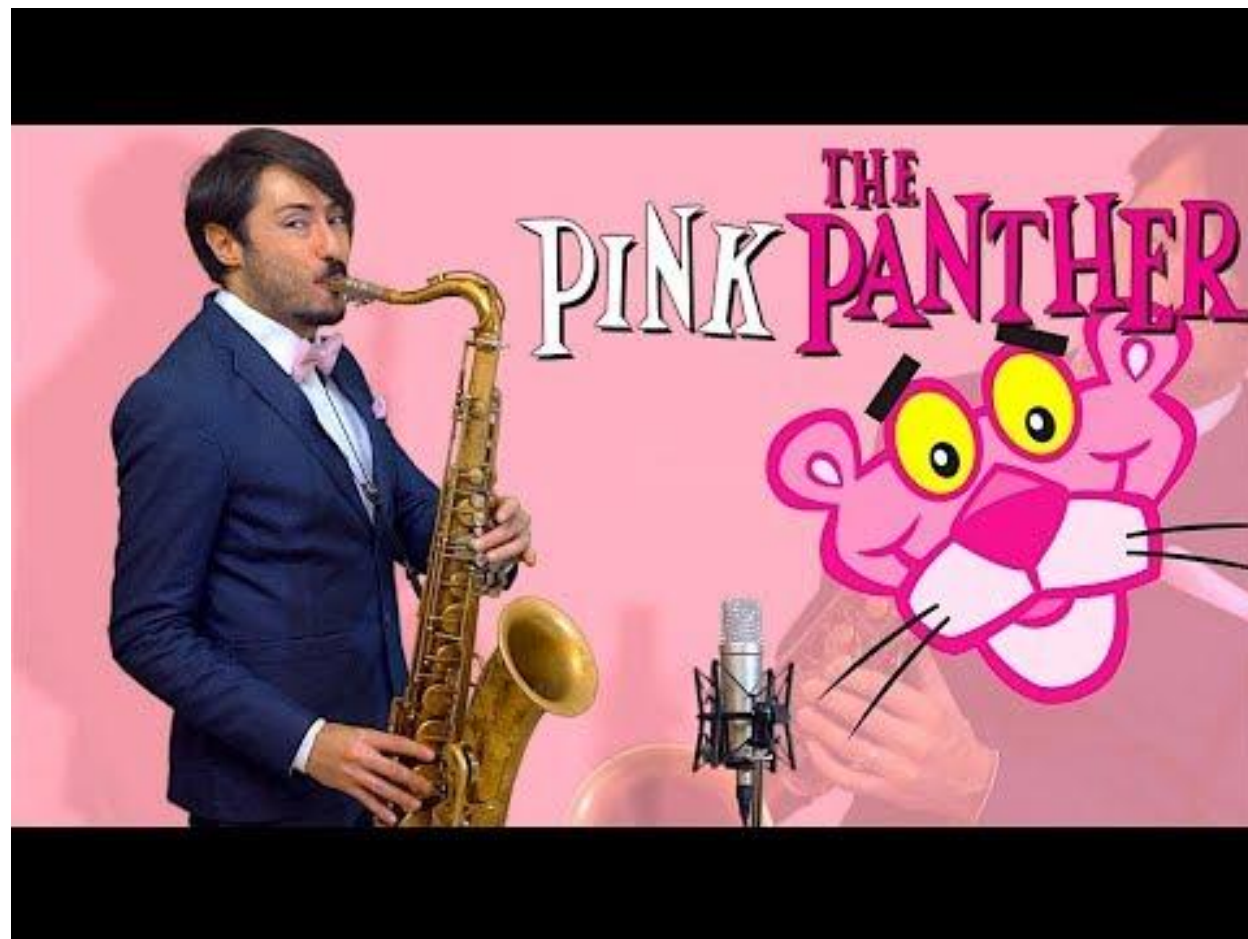
"The Pink Panther Theme" Tenor Sax Cover

Good to know: better for taller students whose hands have good stretch